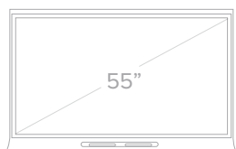
SMART Board 6055

Writing is natural and looks better with SMART ink. Whether you're using a pen or finger, each stroke is a work of art. Its realistic digital ink improves legibility, so teachers don't have to re-write and students feel confident contributing.