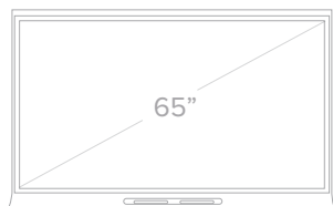
SMART Board 6065